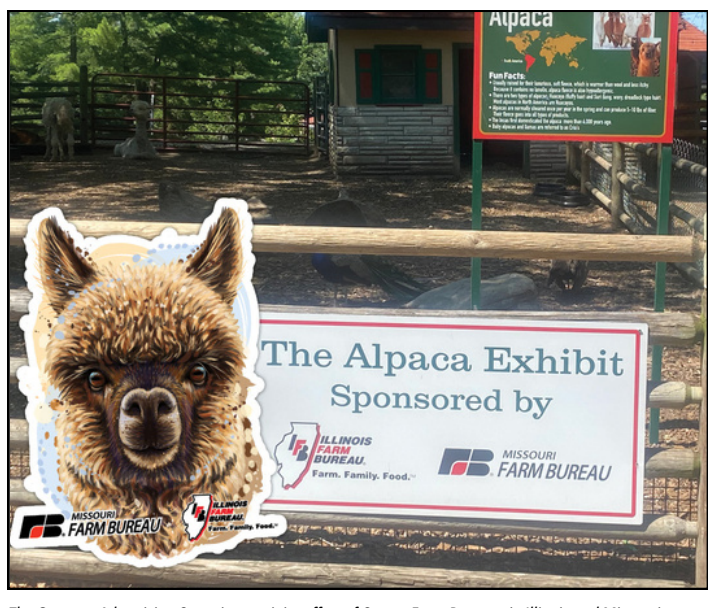
The Gateway Advertising Committee, a joint effort of County Farm Bureaus in Illinois and Missouri, hosted an in-person event at Grant's Farm in St. Louis as part of their Alpaca Exhibit sponsorship for 2024

The Magic House is located at 516 S. Kirkwood Road, one mile north of Highway 44 in historic downtown Kirkwood. For more information visit The Magic House online at www.magichouse.org.