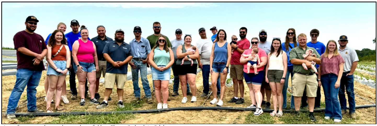
A stop for a group photo at the strawberry fields at Flamm Orchards in Cobden.