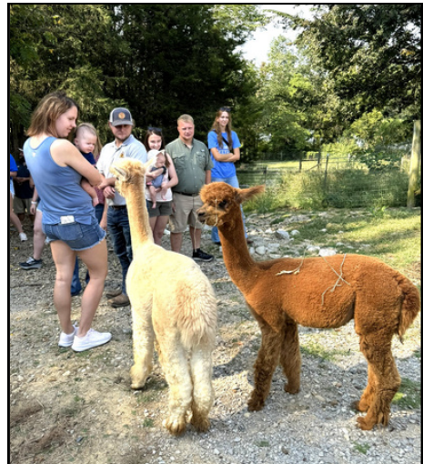
Young Leaders got to get up close to the stars of Rolling Oak Alpaca Ranch in Makanda.