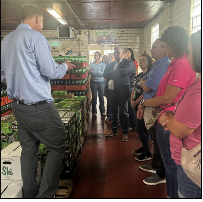
Ski is such a local staple for those that grew up in Clinton County that Excel sells over 45,000 bottles of Ski within Breese for just the locals each week!

the opportunity to take a tour at Excel Bottling, which is a Clinton County staple for most who live here. While in the middle of the tour, Congressman Mike Bost showed up for a visit. AITC Coordinators had the unique opportunity to chat with him about what they do in the classrooms and how they help educate children and adults on how agriculture is a part of our everyday lives.